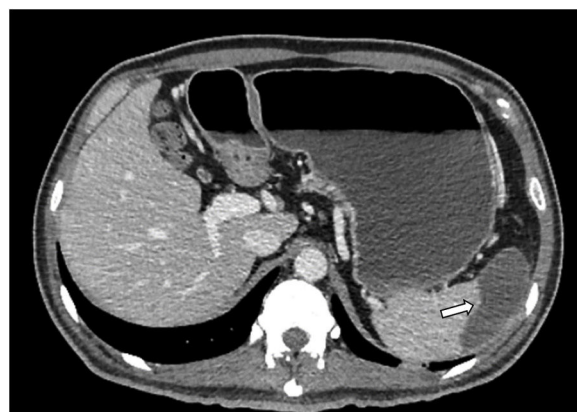
Figure 2 – Computerized axial tomography with contrast. Splenic infarction of the upper pole.

Ten sessions of TPE were performed according to the following characteristics of the patient: 50 kg of weight, 100 cm of height and a hematocrit of 25%. The Spectra Optia apheresis system was used when exchanging 1.0 volume of plasma