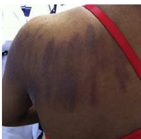
Figure 1 – Flagellate dermatitis in upper back, with hyperchromia and a “whip-like” pattern.

After administration, a hydrolase enzyme metabolizes bleomycin. This enzyme is almost not found in skin and lung tissues which may explain the accumulation and consequent